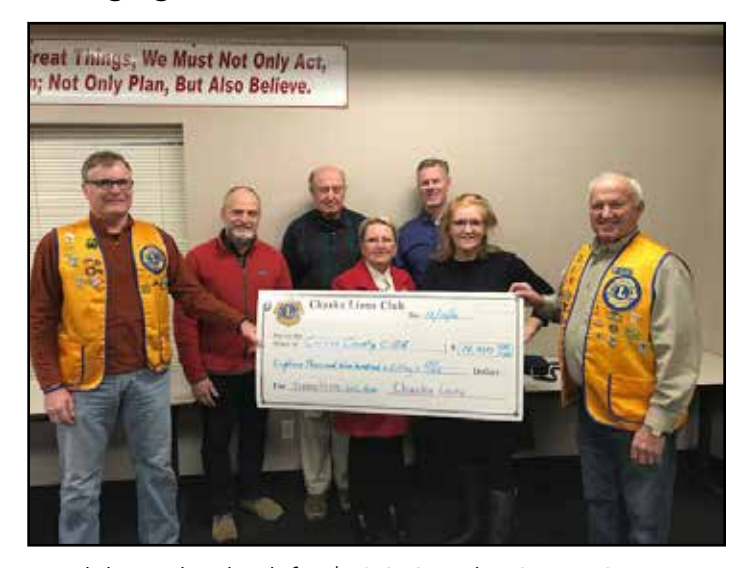
We delivered a check for $18,950 to the Carver County Community Development Authority