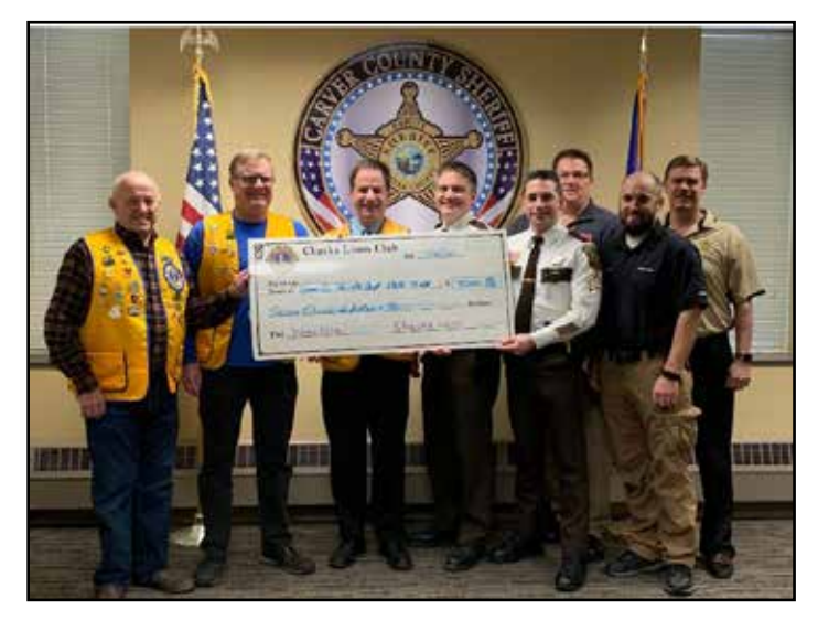
$7,000 to the Carver County Sheriffs Dive Team. They came to us and shared with us what they do for our community. We were able to give them the opportunity to replace older equipment with new safer equipment!